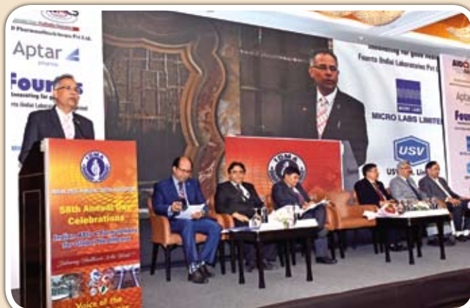
Shri Deepnath Roy Chowdhury delivering the Presidential Address at 58 th IDMA Annual Day Celebrations 2020.