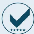
Quality Control and Assurance