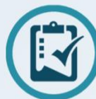
Regulatory Compliance Services