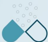
Active Pharmaceutical Ingredients (APIs)