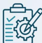
Contract Research Organizations (CROs)